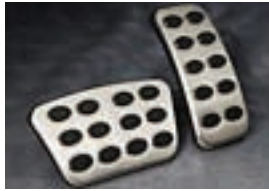
Sport Pedals $85.00