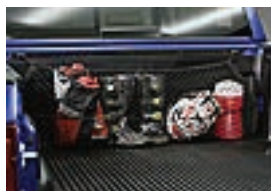
Cargo Net $49.00