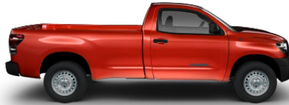
4x2 Regular Cab Long Bed w/4.0-Liter V6 5-Speed Automatic (8204) MSRP** Starting At: $22,620.00