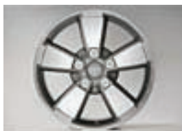
Carved 20" Alloy Wheel $2,200.00