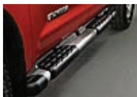
Brushed Stainless Steel Step Board $559.00