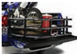
Bed Extender $320.00