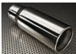
Exhaust Tip $69.00