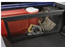
Cargo Divider $330.00