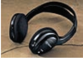
Wireless Headphones $82.00