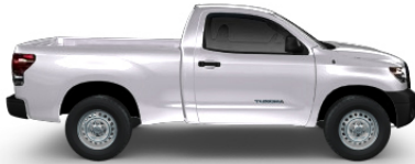
4x2 Regular Cab w/4.0-Liter V6 5-Speed Automatic (8202) MSRP** Starting At: $22,290.00