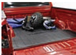
Bed Mat SB/RB - $127.00 LB - $137.00