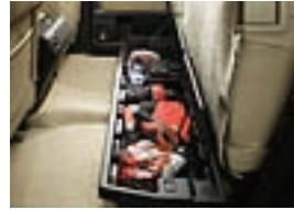
Under Seat Storage $65.00