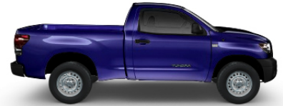
4x2 Regular Cab w/4.7-Liter V8 5-Speed Automatic (8222) MSRP** Starting At: $23,430.00