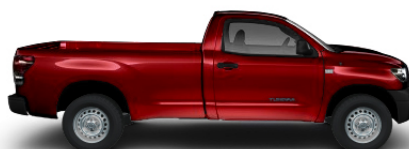
4x2 Regular Cab Long Bed w/4.7-Liter V8 5-Speed Automatic (8226) MSRP** Starting At: $23,760.00