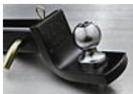
Ball Mounts $29.00