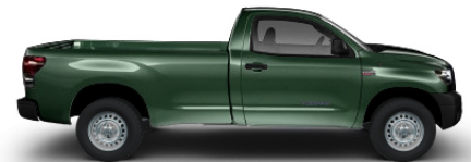
4x2 Regular Cab Long Bed w/5.7-Liter V8 6-Speed Automatic (8228) MSRP** Starting At: $24,710.00