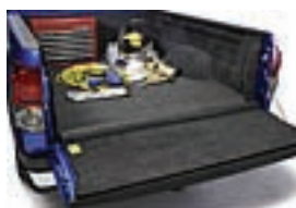
Bed Rug SB - $409.00 RB - $419.00 LB - $434.00