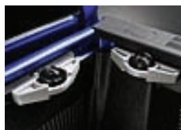
Bed Cleat $42.00