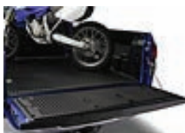
Bedliner w/o Deck Rail SB/RB - $325.00 w/o Deck Rail LB - $355.00 w/Deck Rail SB/RB - $345.00 w/Deck Rail LB - $375.00