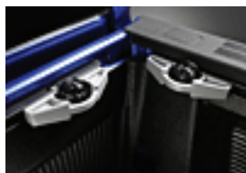
Deck Rail w/Bed Cleats SB/RB - $210.00 LB - $220.00