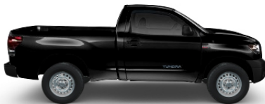
4x2 Regular Cab w/5.7-Liter V8 6-Speed Automatic (8224) MSRP** Starting At: $24,380.00